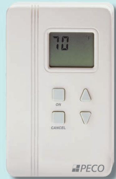
PECO SPD 155-008

Today, this family of commercial zone sensors is available at manufacturer-direct pricing. Giving you, and your customers, a tremendous price advantage.